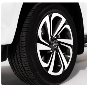
20" Alloy wheels